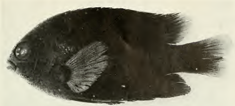
Fig. a. Glyphidodontops niger , holotype, 41.8 mm SL, Cape Nelson, New Guinea.